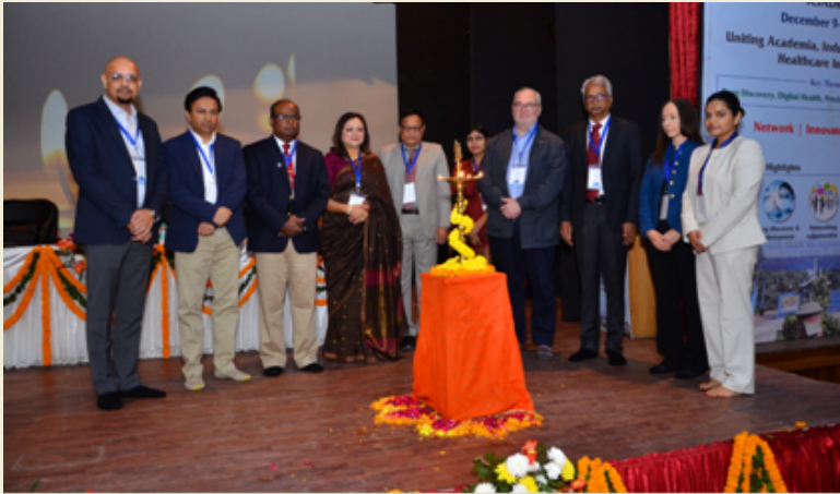
International Conference on Innovation in Advanced Drug Research