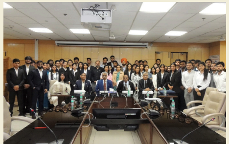
International Seminar on Integrated Medixune: New roles and Applications in Health and Sports