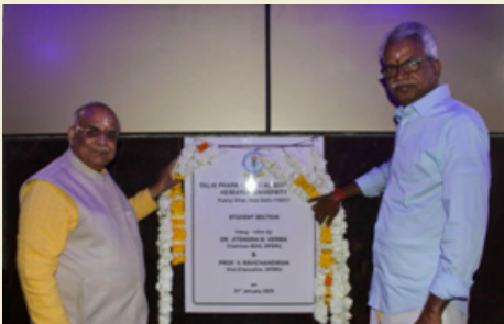
Inauguration of Student Section building