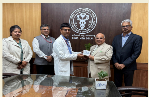
MoU Signing Ceremony with Director AIIMS