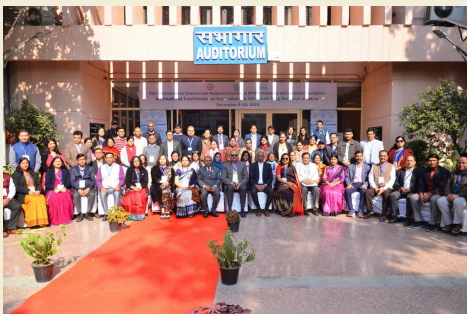
Faculty Members with Drugs Controller General of India (DCGI)